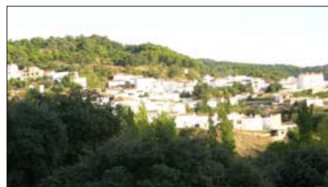
The village of Júzcar, seen from across the valley in afternoon light.